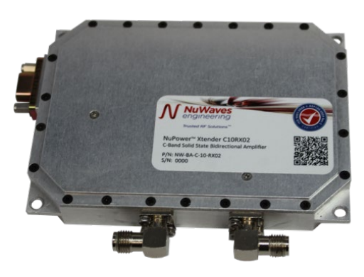
Figure 1 NuPower Xtender C10RX01

NuWaves Engineering is a veteran-owned, premier supplier of RF and Microwave solutions for Department of Defense (DoD), government, and industrial customers. An RF engineering powerhouse, NuWaves offers a broad range of design and engineering services related to the